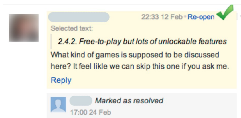
Figure 2. Screenshot of a writing exchange in the online environment

A majority of the global comment initiations embraced the themes major content, content structure, and assignment. One representative example, as illustrated in Figure 2, is “What kind of games is supposed to be discussed here? It feel like we can skip this one if you ask me” (global revision-oriented clarification of major content requested by one of the group members, group ID3). Concerning local comment initiations, they were primarily of the themes content detail, linguistics, and referencing.